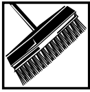
Soft Bristle Brush